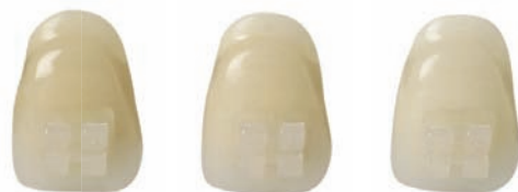
Actual InVu Brackets shown with no color enhancement. Model photos feature actual InVu Aesthetic Brackets.